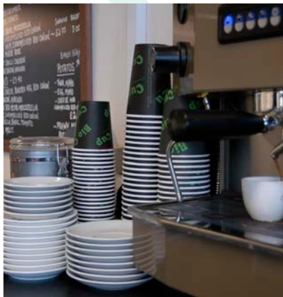
Pepper Cove Café